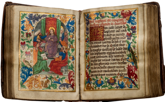
Book of Hours (use of Geert Grote)

In Latin, illuminated manuscript on parchment France (Paris?), c. 1250-1270 63 illuminated foliated initials and 78 historiated initials