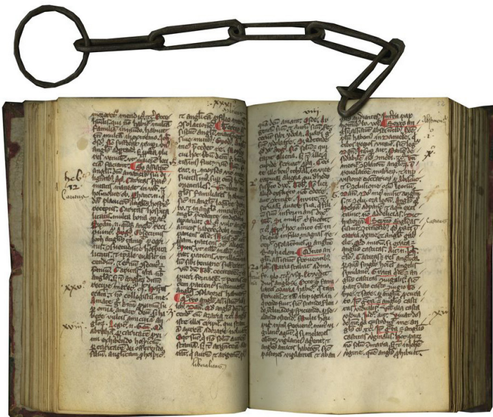
CONRADUS DE SAXONIA [CONRAD HOLTNICKER OF SAXONY], Sermones de sanctis et de communi sanctorum and Speculum Beatae Virginis Mariae [Mirror of the Blessed Virgin Mary]; with Sermons by ALDOBRANDINUS DE CAVALCANTIBUS, ANTONIUS AZARO OF PARMA, MARTINUS POLONUS and unidentified authors

In Dutch, illuminated manuscript on parchment The Netherlands (South Holland), c. 1485-90 With 7 inserted full-page miniatures by the Assumption Master, with borders and initials by the Monkey Master